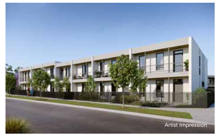
JEON LOT 202