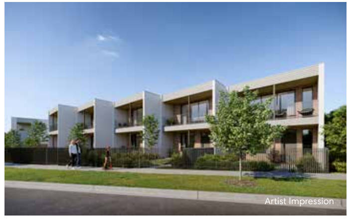
IKON LOT 210, 212